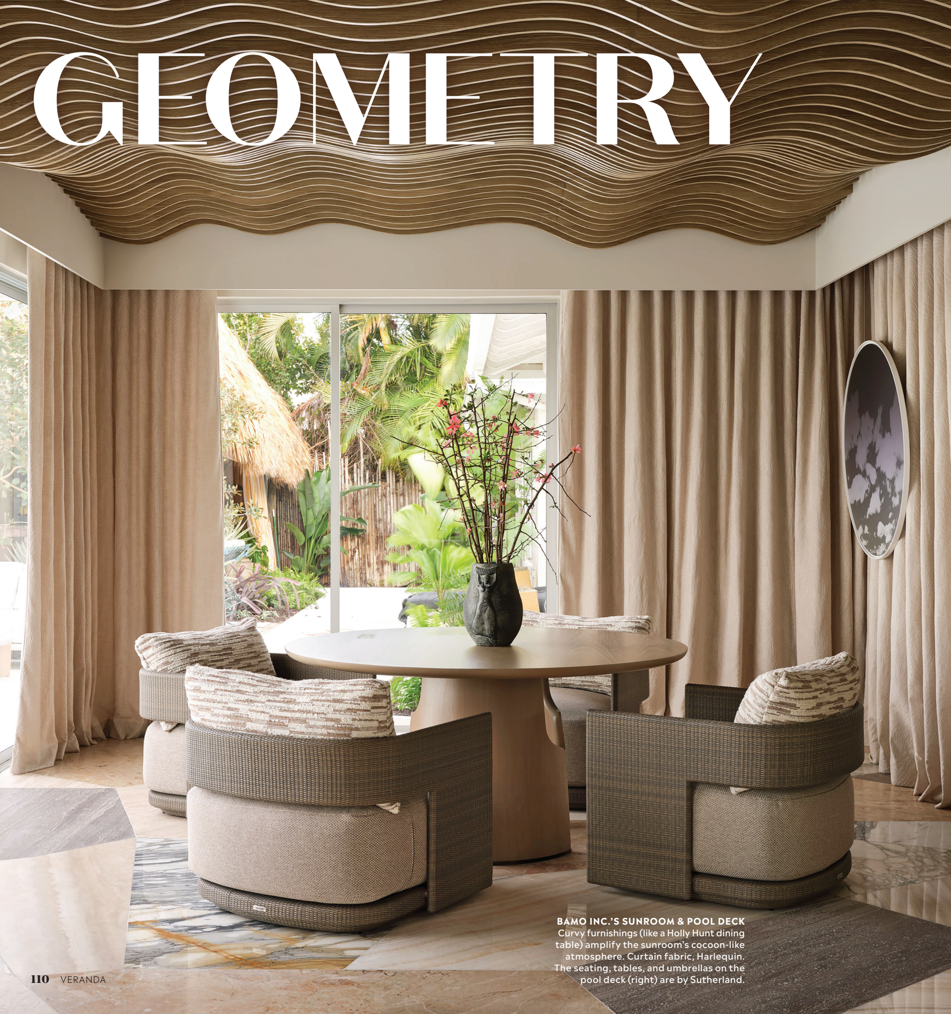
BAMO INC.'S SUNROOM & POOL DECK Curvy furnishings (like a Holly Hunt dining table) amplify the sunroom's cocoon-like atmosphere. Curtain fabric, Harlequin. The seating, tables, and umbrellas on the pool deck (right) are by Sutherland.